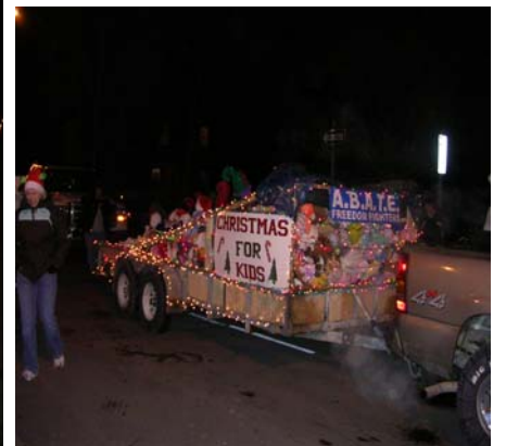
2008 Christmas for Kids Toy Sorting and Float Photos