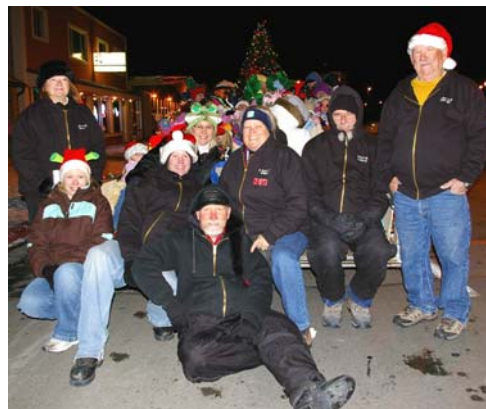
Christmas for Kids Parade of Lights 2008