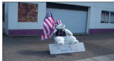
The Patriotic Bear