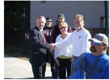
Thank you Senator Gustavson.