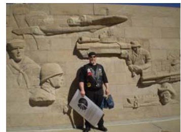
More Photos from Carson City